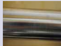
radial lead / spiral-free