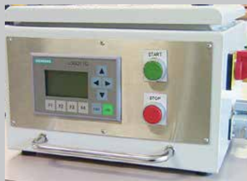
SBA control box automatic for time-regulated cut-in-finishing of individual parts and small series