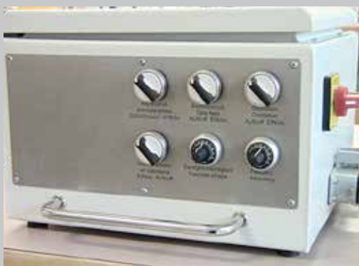
SBM control box manual for manual finishing of individual parts and small series